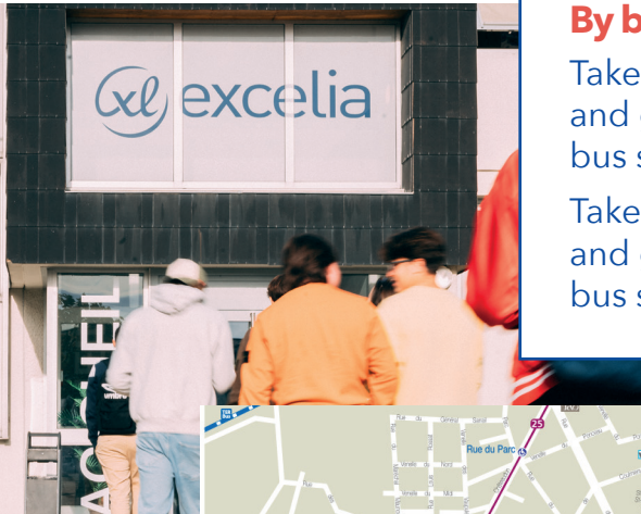
Bus stops for Excelia: Châteaudun and Dunois

Take bus TAO 25 and get off at the bus stop Dunois