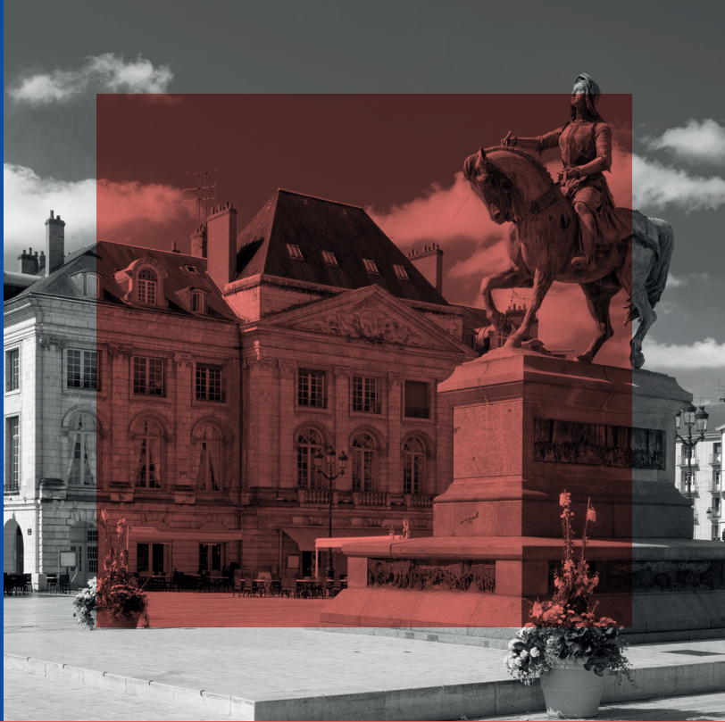
Photos: KOSMOS, Laurinda Hudgens, Seb Poulliard, Sébastien Triphangne, Fotolia, iStock, Adobe Stock, Visaproof, Excellia - All rights reserved - 08/2024. This document is non-contractual. The Management reserves the right to modify course content, dates, and tuition fees.