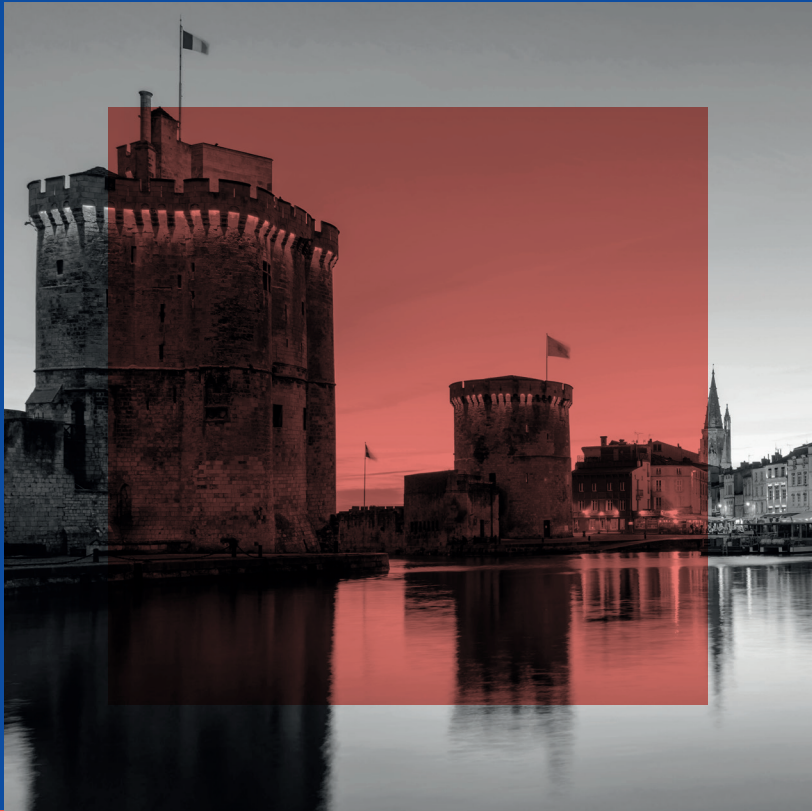
All rights reserved - 08/2024. This document is non-contractual. The Management reserves the right to modify course content, dates, and tuition fees.